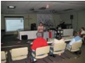
Participants of the "Jump Start" Workshop

Three "Jump Start" workshops were held this winter at the Sparrow's Nest.